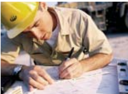
▶▶ Total Compliance Support Training, Installation, Troubleshooting, & More

With MIRATECH Technical Services, you'll have unsurpassed emissions control expertise and vast