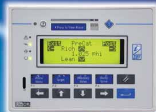
TARGET (RICH / LEAN) ADJUSTMENT